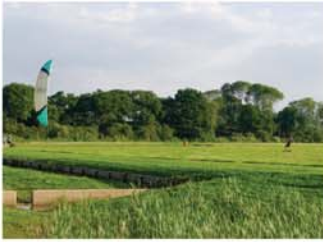
Open space with integrated SUDs, Upton