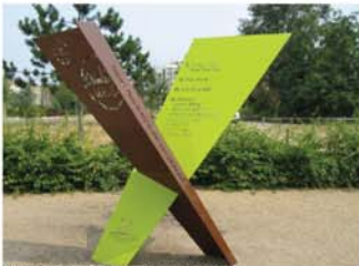
Wayfinding/Sculpture, Mile End