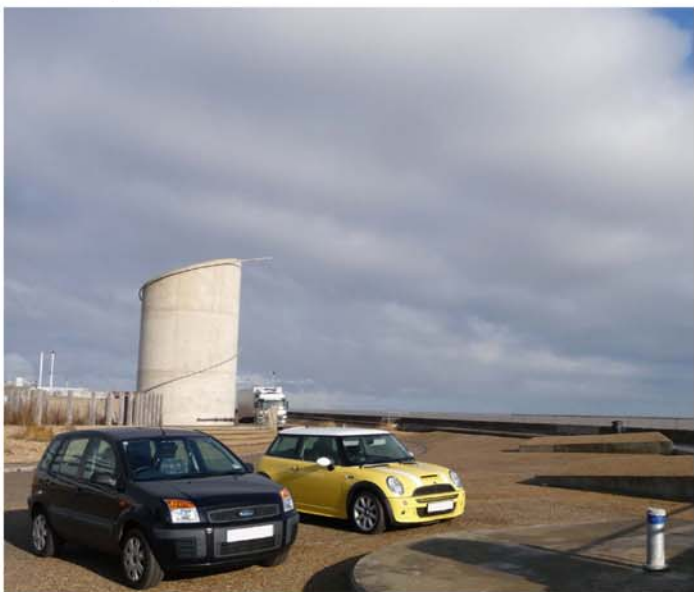
Car parking adjacent to Ness Point