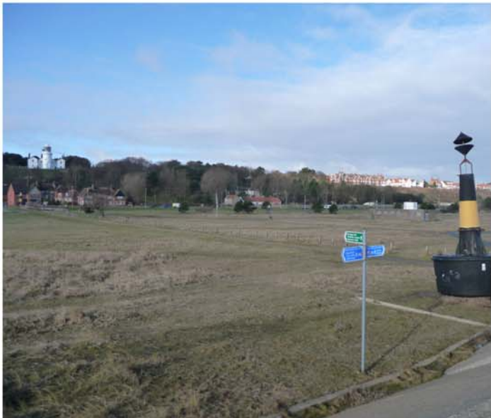
North Denes Open Space