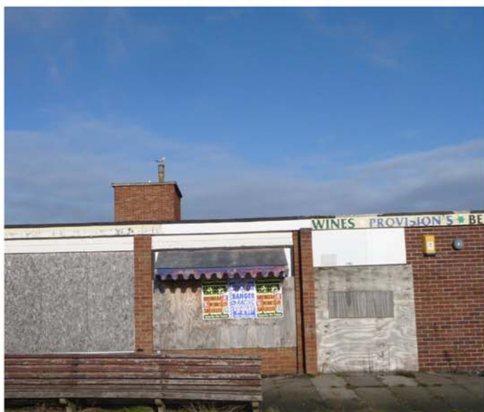
Derelict tourism facilities, North Denes Caravan Park