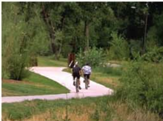
Pedestrian and cycle path