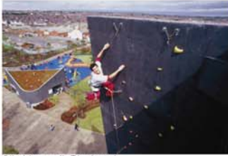
Climbing wall, Blackpool