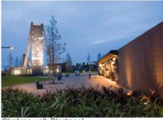
Climbing wall, Blackpool