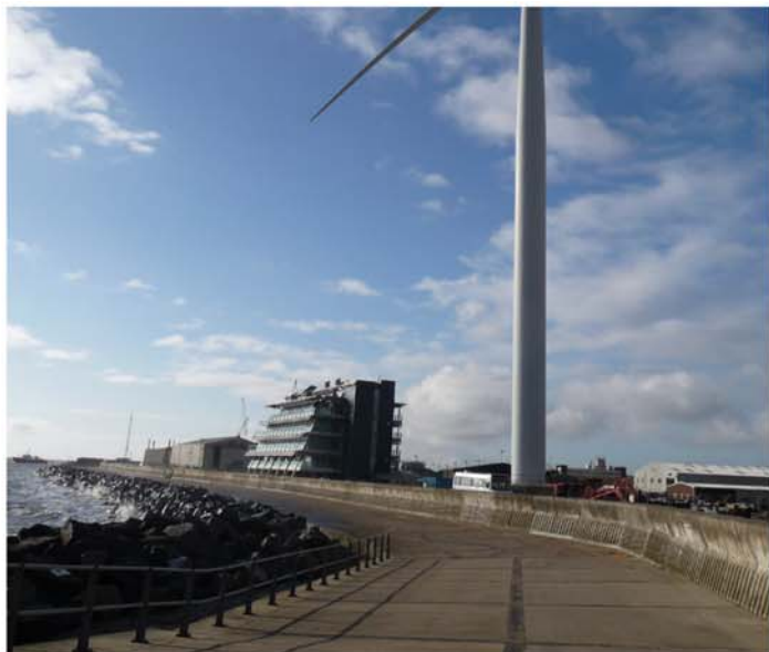
Sea defences/view to OrbisEnergy from Ness Point