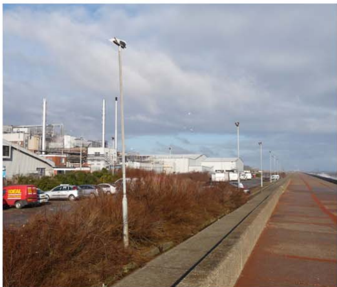
Sea defence and Birds Eye factory