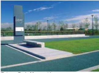
Estuary Park, Merseyside